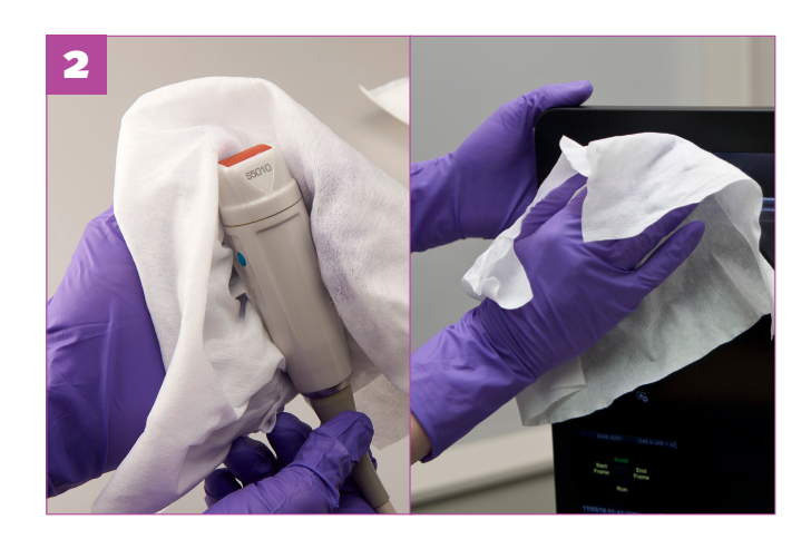
Use the wipe to disinfect the skin surface probe. Use another wipe to disinfect the monitor, keyboard, probe holders and cables.