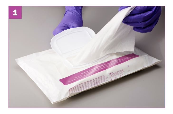
Take one Tristel Solo for Ultrasound disinfectant wipe.

Disinfectant wipes for skin surface probes and ultrasound stations